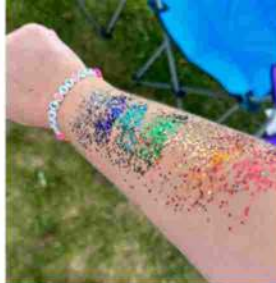
The Village sponsored booths at Pride in the Park events in Alexandria, Minot, St. Cloud, and Fargo.