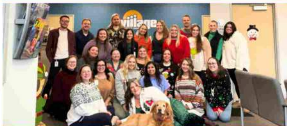
Moorhead crew get their festive groove on as they celebrate the holidays in style.