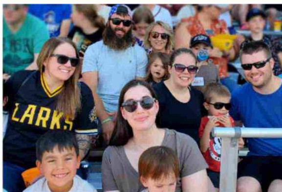
Bismarck staff attended a Lark's baseball game during Blue Cross Blue Shield's Strike out the Stigma campaign where funds were raised to help support The Village.