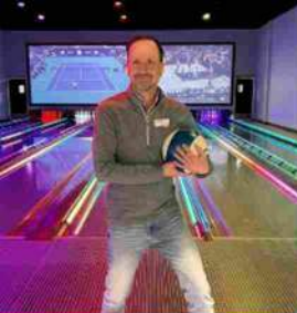
Big Brothers Big Sisters held their annual Bowl for Kids' Sake event at new location, Kingpinz.