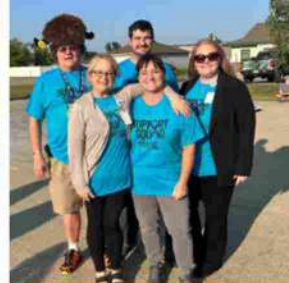
First Step Recovery staff celebrate Recovery Month at the annual Recovery Event held at The Village.